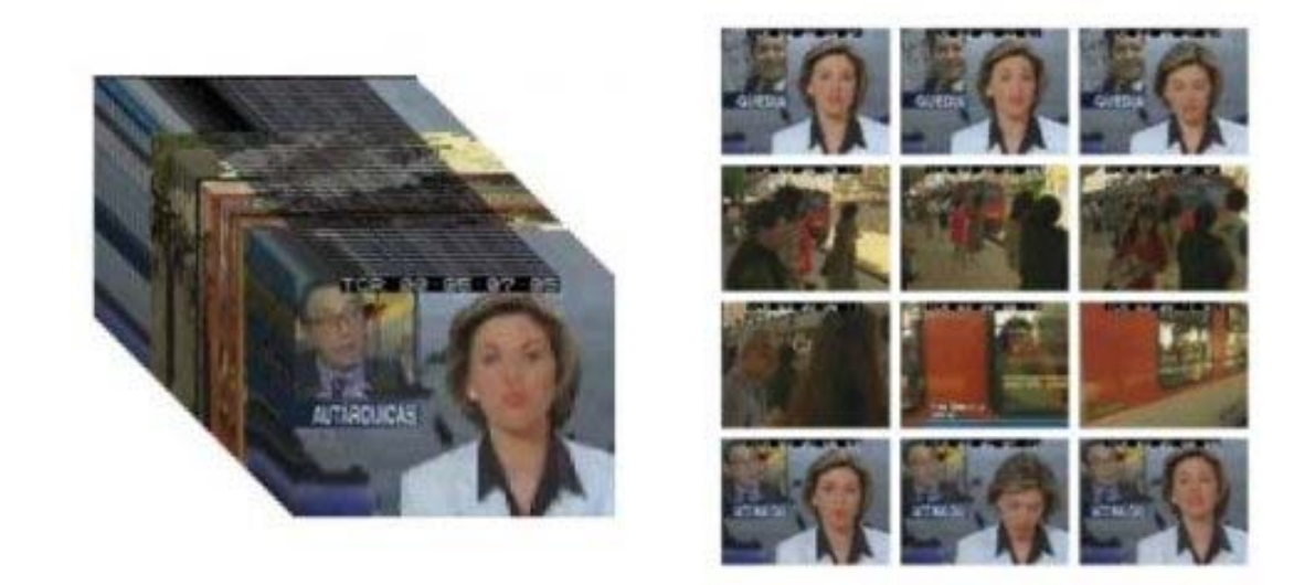
Fig. 2 Video Streamer and VideoIndex. Video user interface techniques that show the structure of the video The images in the index are chosen with image processing algorithms for shot detection.

scribing the content, by adding metadata to it. To each video stream a set of descriptors can be added, that will describe the different aspects of the content. The layers of annotation are stored with the MPEG-7 standard, to allow interoperability with other annotation tools. In VideoStore we intend to combine the two annotation perspectives that we have in our previous work. Users will be able to add annotations in order to add to the existing materials and metadata will be used to describe the content and generate the different visual representations and interfaces that will be used to interact. The VAnnotator project also introduced the concept of video lenses, to provide interpretations of the multimedia content and give different perspectives of the information. These video lenses will also be reused in VideoStore, allowing for personalized views of the materials. Video lenses can be used to provide alternative representations to the same content or they can be used to filter out information that is not necessary for a given task.